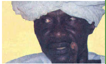
Ali Kushayb since 27 April 2007