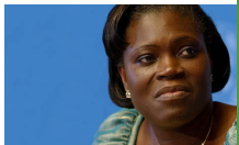
Simone Gbagbo since 29 February 2012