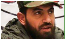
Mahmoud Mustafa Busayf Al-Werfalli since 15 August 2017