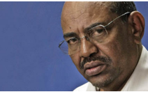
Omar Al Bashir since 4 March 2009