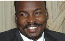
Ahmad Harun since 27 April 2007