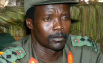
Joseph Kony since 8 July 2005