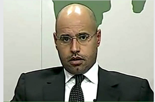
Saif Al-Islam Gaddafi

Charges: 10 counts of crimes (5 crimes against humanity, 2 war crimes and 3 crimes of genocide) committed from 2003 to 2008 in Darfur, Sudan, as the President of the Republic of Sudan.