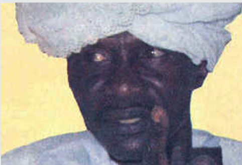
Ali Muhammad Ali Abd-Al-Rahman (“Ali Kushayb”)

Charges: 32 counts of crimes (11 crimes against humanity and 21 war crimes) committed from 2002 to 2004 in Uganda, as an alleged Vice-Chairman and Second-in-Command of the LRA.