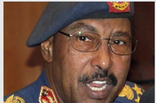
Abdel Raheem Muhammad Hussein

Charges: 4 counts of crimes against humanity, committed from 2010 to 2011 in Côte d'Ivoire, as a member of President Gbagbo's inner circle.