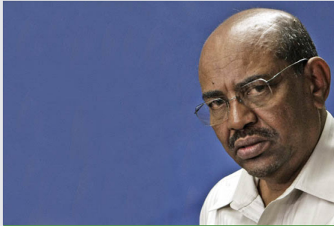
Omar Hassan Ahmad Al Bashir

Arrest Warrants: 4 March 2009 12 July 2010