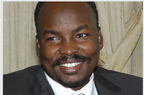
Ahmad Muhammad Harun

Charges: 50 counts of crimes (22 crimes against humanity and 28 war crimes) committed from 2003 to 2004 in Darfur, Sudan as a Senior Commander of the Janjaweed militia.